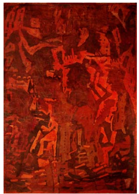
Georges Fikry Ibrahim The Farmer, 2006 Mixed media on paper, 33.9 x 93.3"

Arab artists? What role do Islam, the history of the region or the after-effects of Europe's colonial policy play in them? How much do they reflect biographical situations such as exile or global nomadism.