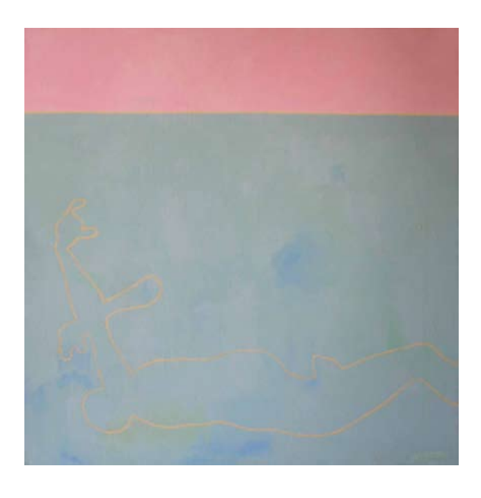
Ayman El Semary Deeping Quite, 2008 Acrylic, prayton, acrylic oxides on canvas, 59.1 x 59.1" 2008